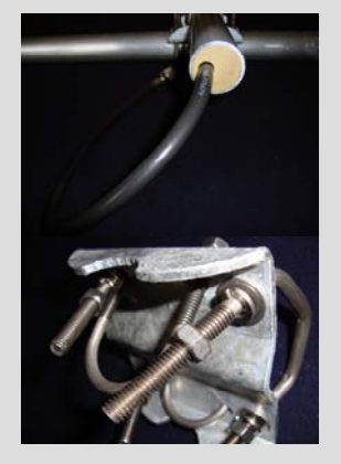
Natural rubber plugs & Heavy-duty galvanized clamp w/S.S. hardware

*Site-specific mounting masts and clamps are recommended for Delta0 Series antennas. Please consult JAG to determine suitable accessories for your application