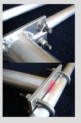
Heavy-duty dipole fixture